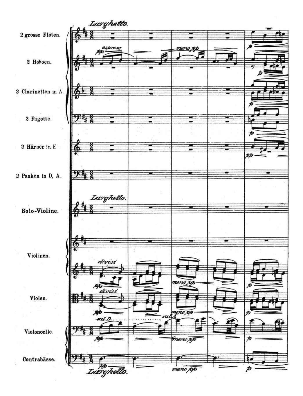
Example 1. Max Reger, Romanze in D major, Op. 50 no. 2, orchestral score, first edition: Munich: Jos. Aibl, 1901, bars 1–5 (merged)