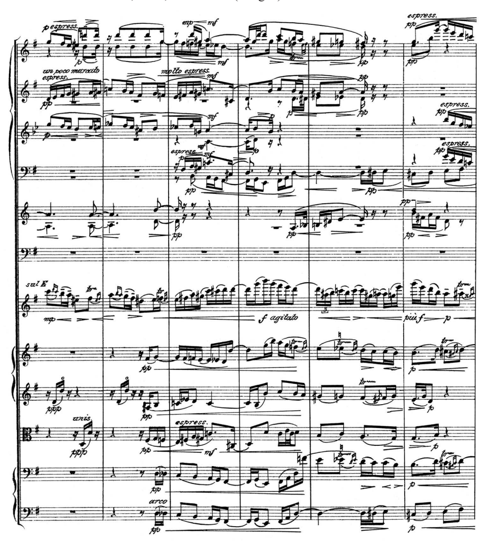
Example 11. Max Reger, Romanze in G major, Op. 50 no. 1, orchestral score, first edition: Munich: Jos. Aibl, 1901, bars 13–18 (merged)

Yet, while most of his contemporaries use techniques of orchestration deeply rooted in the late 19th century, Reger even in his Op. 50 Romanzen foreshadows the future developments of the Twentieth century. His dynamic markings, as nearly always in his music, show particular attention to detail, shadowing the separate sections of the orchestra meticulously (even frequently when instruments are coupled or linked). The sophisticated markings related to the dynamics both in the solo as in the orchestral part, encompassing the entire span of softest piano to double forte , show the advancedness of Reger's musical thinking, only little of which can also be found in contemporaneous