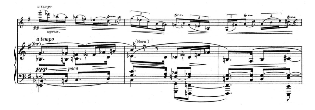
Example 3. Max Reger, Romanze in G major, Op. 50 no. 1, piano score, first edition: Munich: Jos. Aibl, 1901, bars 94–96

The increasing density of the solo part is striking, while the textures in the piano are fairly similar to those in Op. 50, both with respect to playability as to performance markings.