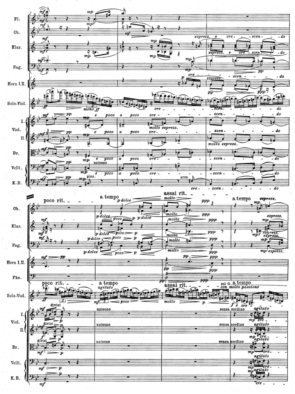
Example 2. Max Reger, Violin Concerto in A major, Op. 101, orchestral score, first edition: C.F. Peters, 1908, 2nd movement, bars 57–63

Also concerning orchestral complexity and refinement, the Violin Concerto shows another step in Reger's development, as the composer wrote whilst composing, to his publisher: 'it is much more difficult to orchestrate such a thing than a purely orchestral