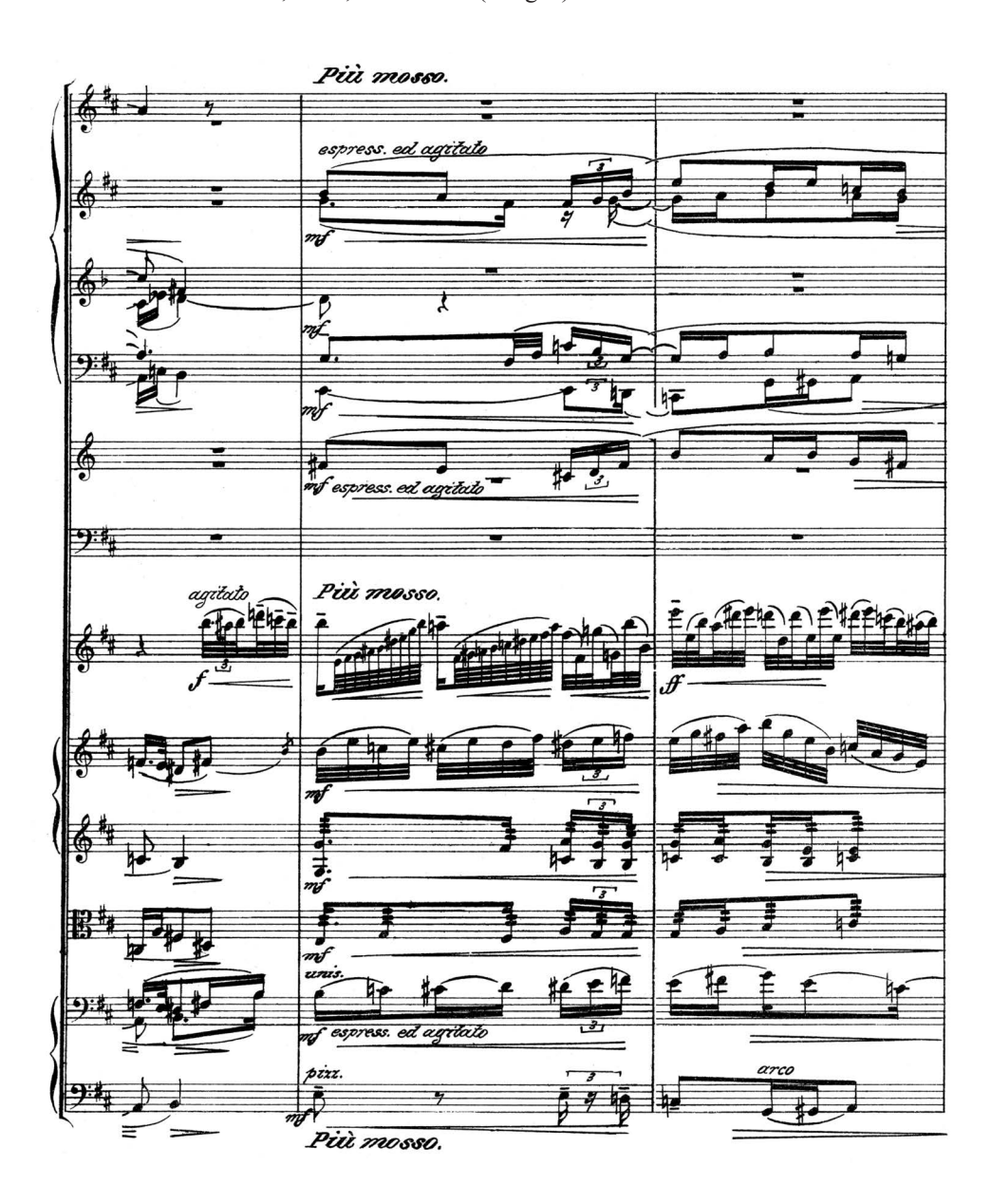
Example 7. Max Reger, Romanze in D major, Op. 50 no. 2, orchestral score, first edition: Munich: Jos. Aibl, 1901, bars 47–49 (merged)